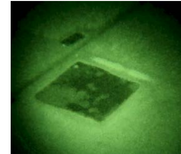
IR LED Test Zone through NVG's (field reservoir illuminated @ 500 ft AGL)