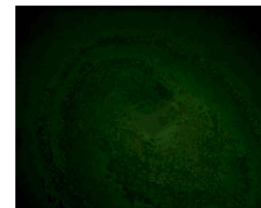
IR LED Test Zone through NVG's (field reservoir NOT illuminated @ 1,500 ft AGL)