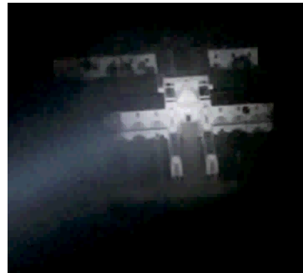
Nightsun XP in wide focus @ 1,200 ft.