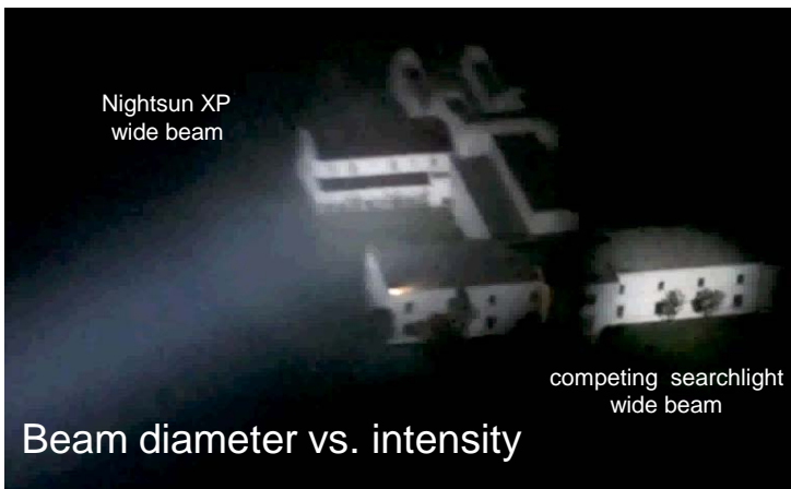
Beam diameter vs. intensity