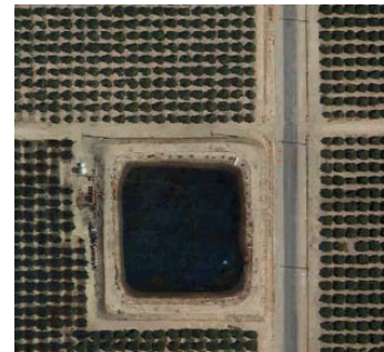
IR LED Test Zone (farm field reservoir)