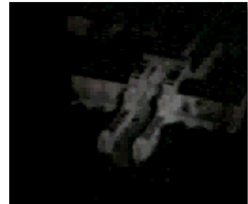
Competing searchlight (800 Watt) in wide focus @ 750 ft.