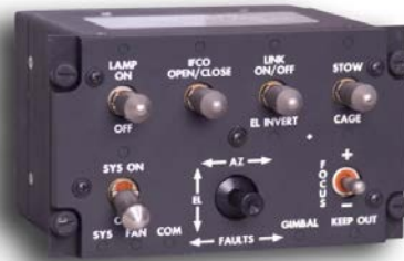
Mil-Spec qualified Nightsun® XP Console Control Panel (optional)