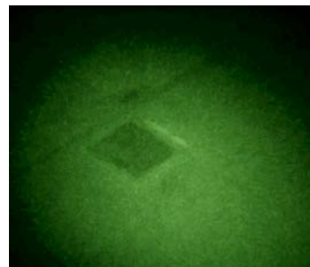
IR LED Test Zone through NVG's (field reservoir illuminated @ 1,500 ft AGL)